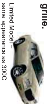
Limited Model – same appearance as 300C