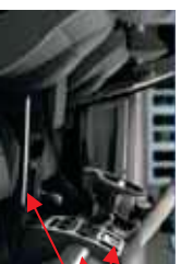
Bright Interior Trim Accents LX Interior